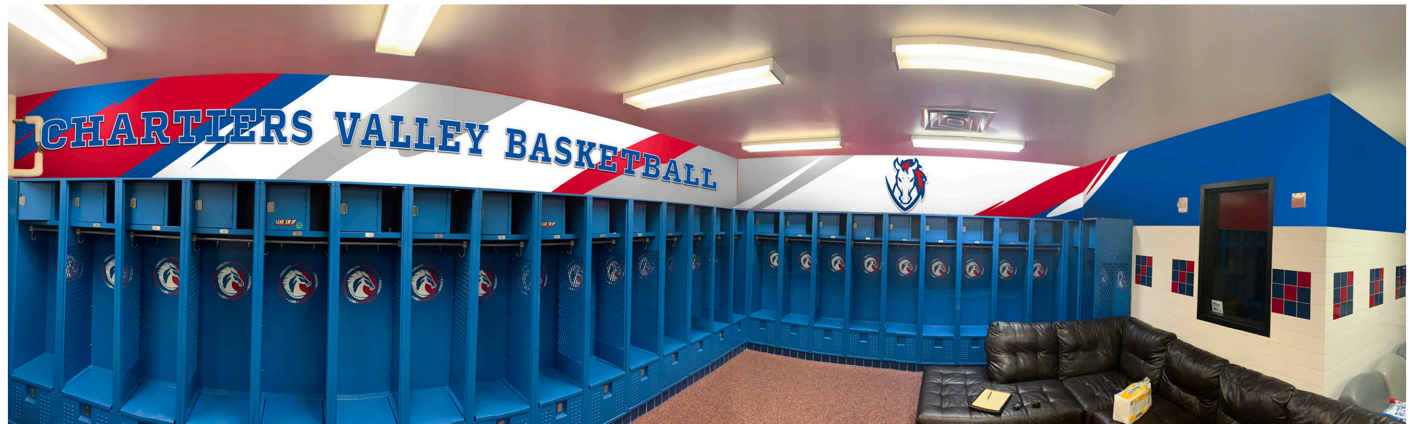
Mock-Up 1 | Version 2

18 West Steuben Street Pittsburgh, PA 15205 P: 412-922-0422 novum-designs.com