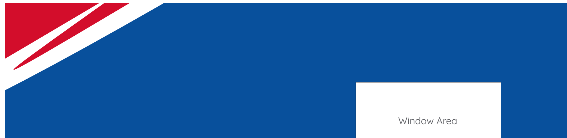
Wall Location 3 | Wall Wrap Size: 147.625"(w) x 35.5"(h) | Dimensional Letters: 104"(w) x 7.25"(h)

18 West Steuben Street Pittsburgh, PA 15205 P: 412-922-0422 novum-designs.com