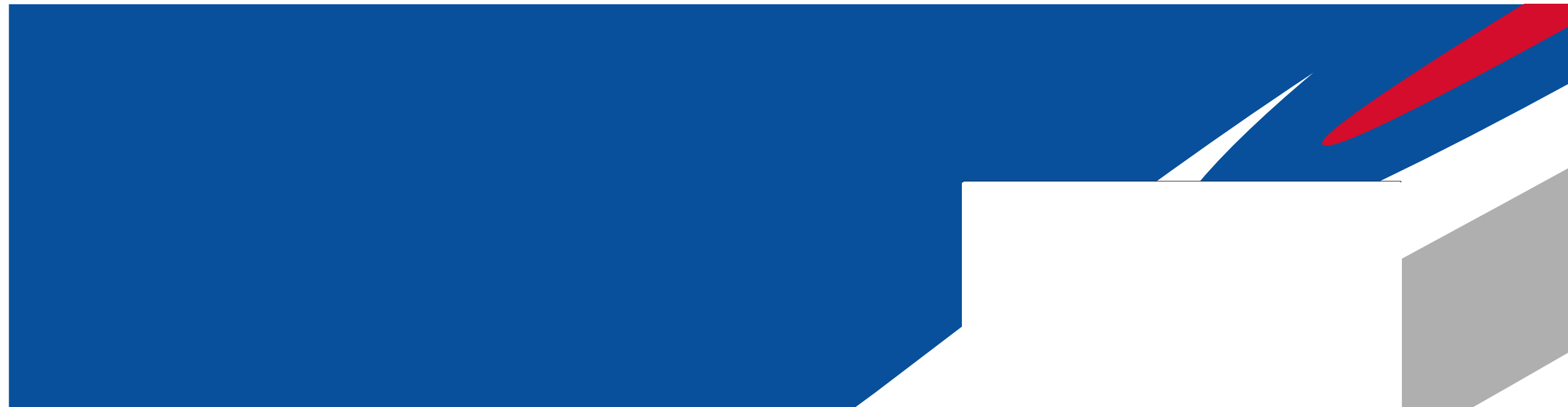
Wall Location 4 | Wall Wrap Size: 134.625"(w) x 35.5"(h)

18 West Steuben Street Pittsburgh, PA 15205 P: 412-922-0422 novum-designs.com